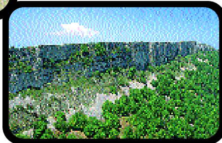
Rocks on Mount Vallegrull

Prehistoric man likewise left the occasional trace of his life, both in caves and in the shape of megalithic monuments (the tumulus of San Lorenzo, the monolith on Mount Lerón). The Roman period is likewise present with the remains of a road, and some lovely medieval paintings in Ribera church. The harsh living conditions of the area have left their mark on the ruined walls of the now uninhabited villages of Ribera and Villamardones.