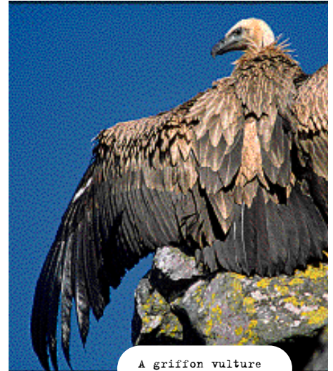
A griffon vulture

Perhaps the best known fauna in Valderejo is the colony of griffon vultures, the biggest in the Basque