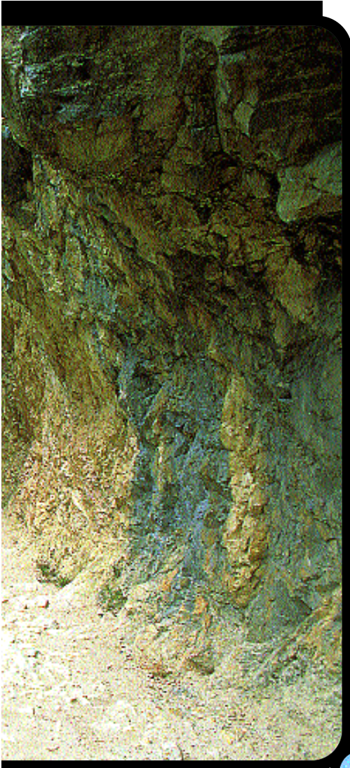
The river Purón and its canyon

A high, spacious valley enclosed by steep hillsides ending in rocky cliffs is probably the best way to sum up the landscape of the Valderejo Nature Reserve.