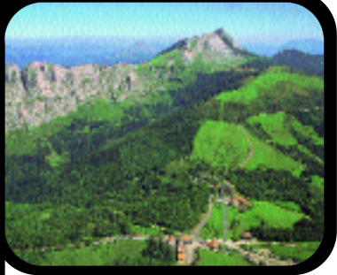
A view of Urkiola pass.

occupy an important part of the surface, there are still a number of vast natural beech forests such as those of Arangio, Eskubaratz or Urkiolamendi.