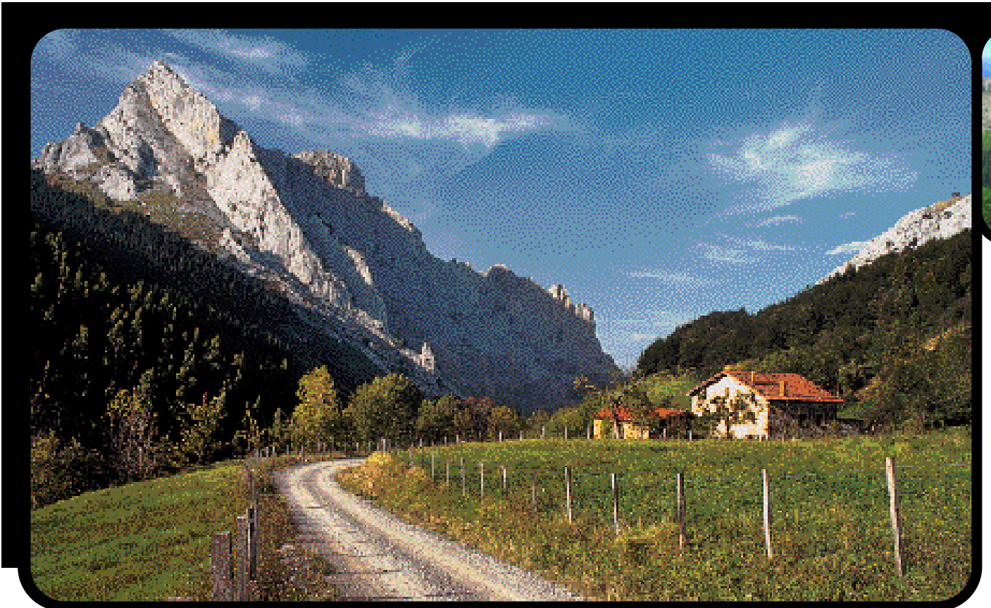
The white of the limestone rocks contrasts with the green of the meadows, forests and plantations.

Urkiola stands at the centre of the mountains on the Cantabrian-Mediterranean watershed. The Nature Reserve takes its name from the pass running through it from north to south, and from the Sanctuary (of San Antonio or Urkiola) standing on the summit, the geographic centre of the area. Etymologically speaking, Urkiola comes from "urkia", the Basque name for the birch tree so easily found in the area. The land belongs mainly to Bizkaia, but also to Alava.